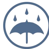
Water Resistant: IP67