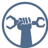
Rigid Body: Impact 8J